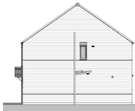
Right Elevation 1 : 100